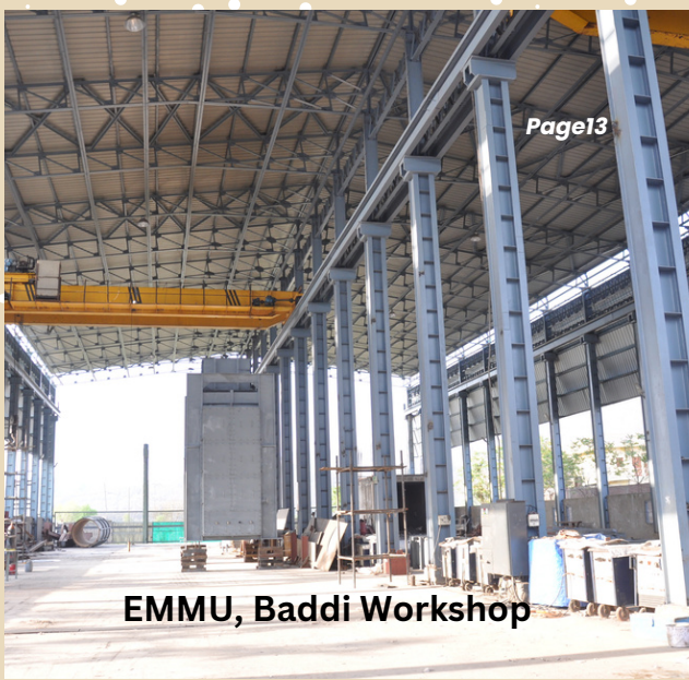
EMMU, Baddi Workshop