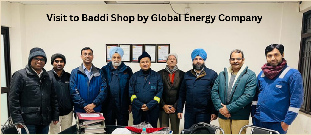
Visit to Baddi Shop by Global Energy Company